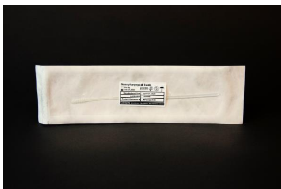
Origin ETO Sterilized NP swab individually packaged