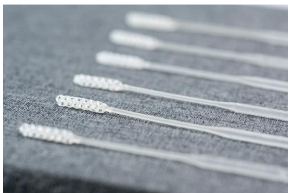
Collaboration between Henkel and Origin: 3D printed NP swabs showing the detailed lattice structure